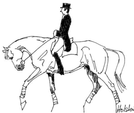
Diagram ii Low, deep and round